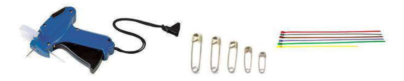
Tag Gun or Safety Pins (for attaching Bar Coded Price Tags)