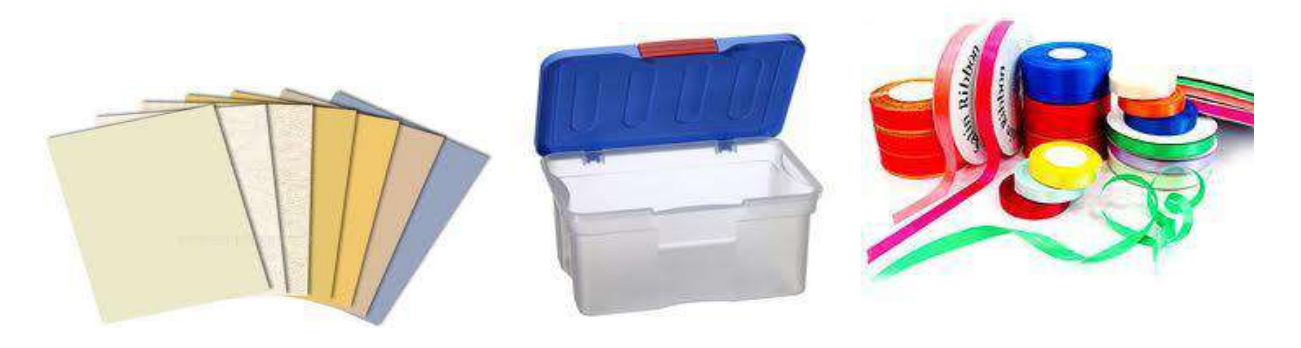
Cardstock Paper (for Tag printing)